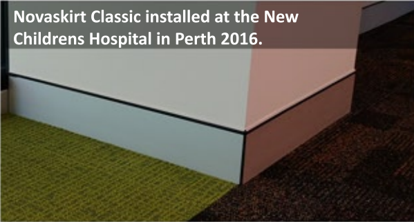
Novaskirt Classic installed at the New Childrens Hospital in Perth 2016.