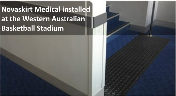
Novaskirt Medical installed at the Western Australian Basketball Stadium