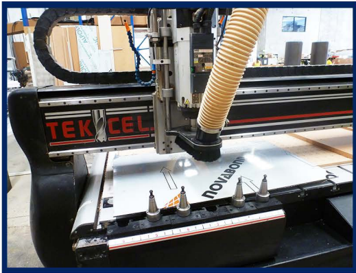
Novabond sheets being cut to size.