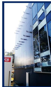
Prior to installation