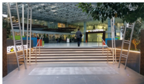
Nugrid installed at PBG Centre in Perth 2016

(Note: Nugrid & Matting directions are opposite)