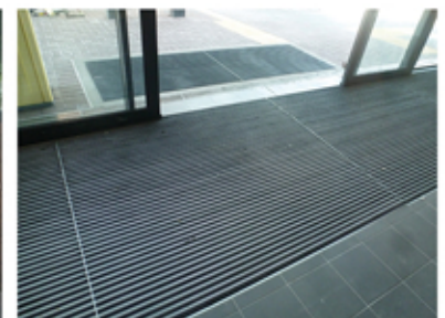
Nugrid installed at Aubin Grove Station in 2017