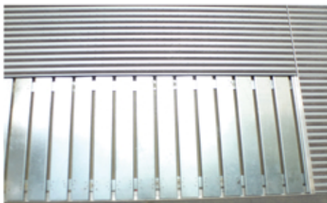
Nugrid drainage system

(Note: Nugrid & Matting directions are opposite)