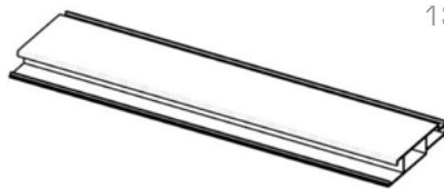
130x25mm CLADDING 6.015M